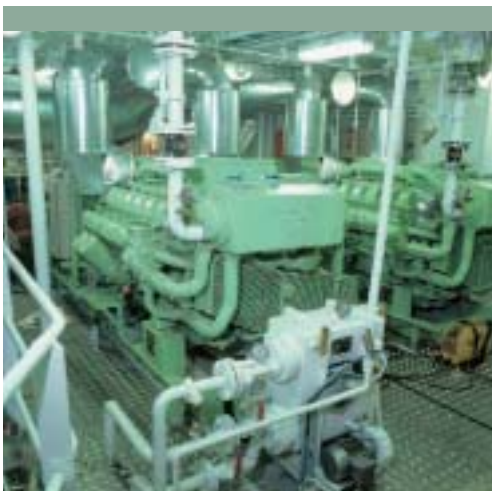
Engine room with DEMP plants.

THE PLANTS ARE BASED ON A STANDARD DESIGN CONCEPT THAT CAN BE CUSTOMIZED TO MEET INDIVIDUAL REQUIREMENTS.